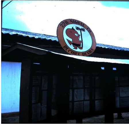
Photo 1. Headquarters, 228 Signal Co.

Many of the locations mentioned in 228 are actual places in Vietnam visited by the author during his tour of duty (1966-1967). Below are photos taken by the author himself. Click on the thumbnails below to get a larger image of the photo. More will be added in the coming weeks.