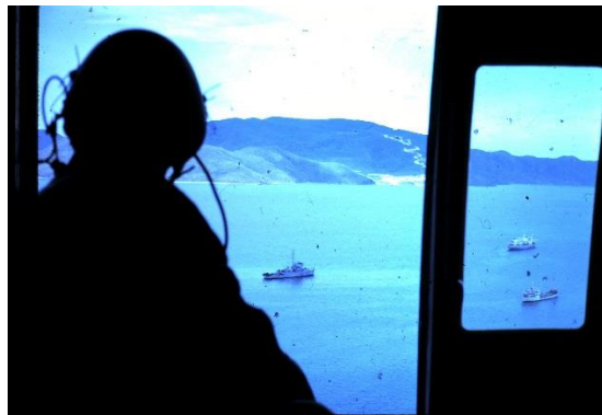
Photo 4. Hon Tre Island from the air