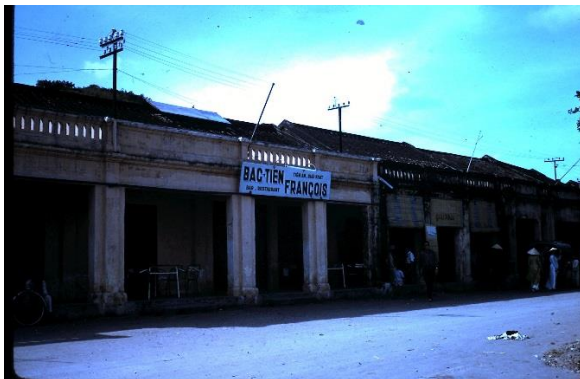
Photo 3. Francois Restaurant, Cau Da