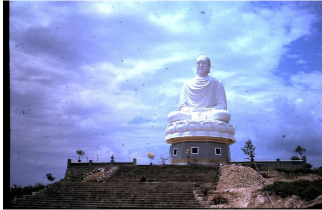
Photo 2. Giant White Buddha, Vietnam.